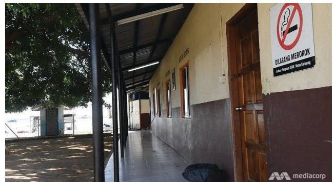
This small building accommodates more than 200 students from the age of four to 17 on weekday mornings.

The school aims to equip stateless children with the basic educational skills of reading, writing and counting, but it does not offer its students the opportunity to take national examinations or to graduate with any certificate that will help them apply for a job.