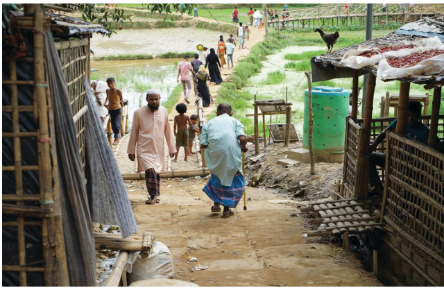
Bangladesh 2019

do anything more. We hold our frustration inside because we cannot speak out—there are no opportunities for that. We cannot even travel to the next township, so people keep everything inside, bottled up.”