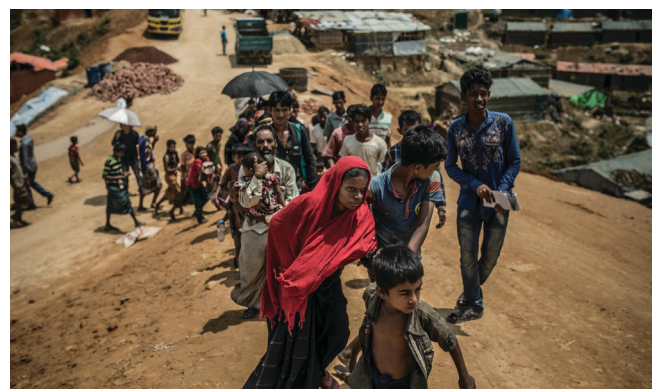
Bangladesh 2017

To date no meaningful solutions have been offered to the Rohingya people, who have been pushed to the margins of society in virtually all of the countries to which they have fled. In Bangladesh, more than 912,000 Rohingya still live in the same basic bamboo structures as when they first arrived. They face travel and work restrictions, and remain wholly reliant on humanitarian aid.