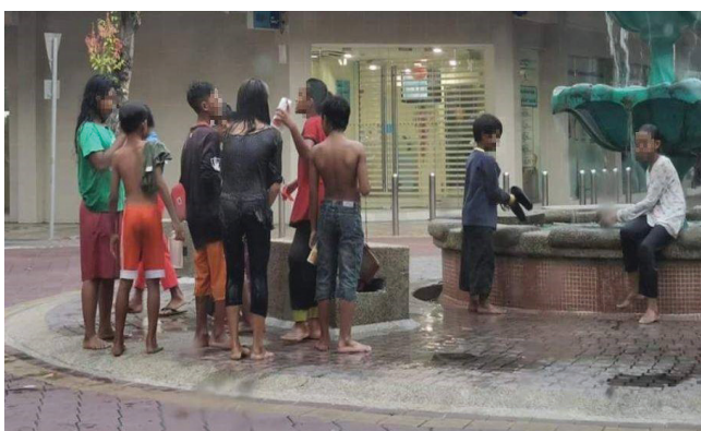
Children of sea gypsies taking a dip at Kota Kinabalu’s Gaya Street fountain that triggered a social media storm

KOTA KINABALU: A group of sea gypsies or Pelahu children are posing a “headache” for authorities as they beg and mess around with the facilities around the city centre. The children, numbering about 30, have been rounded up and lectured about their activities but to no avail as some of their parents were also going about begging along the streets with authorities having little power or laws to act.