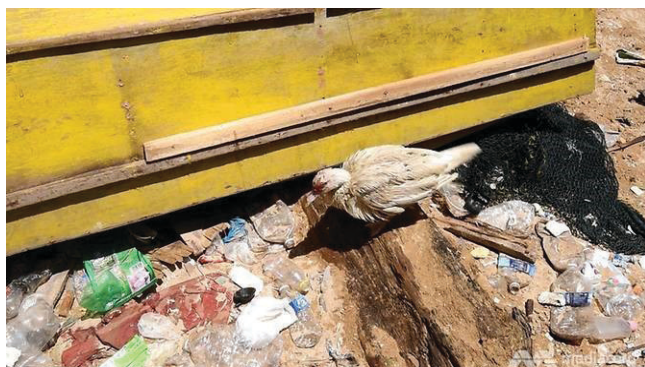
Farm animals owned by the Bajau Laut community are also impacted by the trash situation in Kampung Berhala.