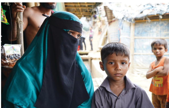
Bangladesh 2019

Many of the illnesses Doctors Without Borders/ Médecins Sans Frontières (MSF) teams treat at our clinics in Cox’s Bazar are a result of the poor living conditions that the Rohingya endure, with poor access to clean latrines and water. We have provided more than 1.3 million medical consultations from August 2017 to June 2019, and continue to treat tens of thousands of patients a month.