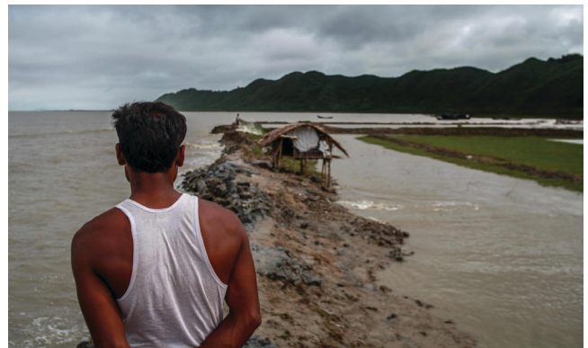
A young man looks on at the outskirts of Ah Nauk Ye camp. Myanmar 2019